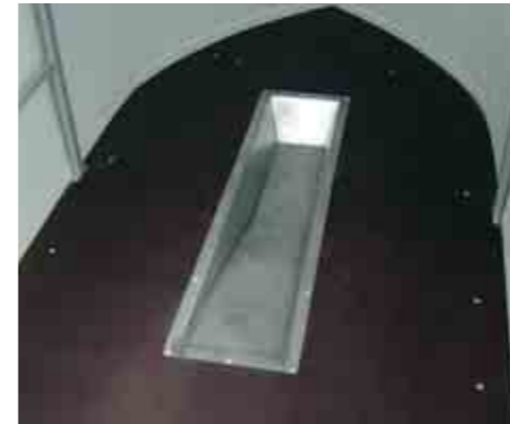
Tray for bikes higher than 150 cm

On inquiry we can offer further solutions to extend the usefulness of the trailer.